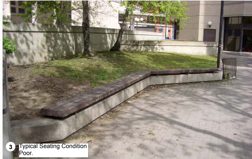
3 Typical Seating Condition Poor.