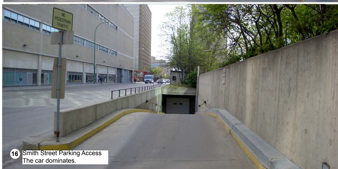
16 Smith Street Parking Access The car dominates.