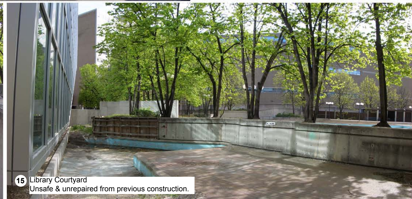
15 Library Courtyard Unsafe & unrepaired from previous construction.