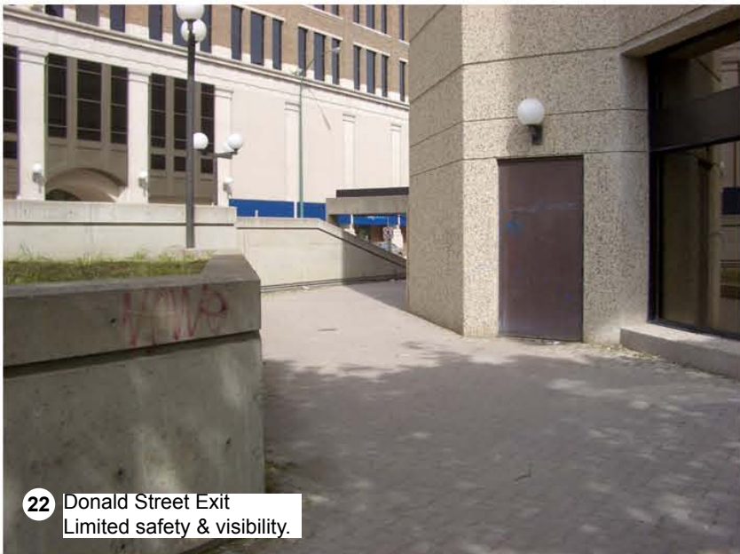
22 Donald Street Exit Limited safety & visibility.