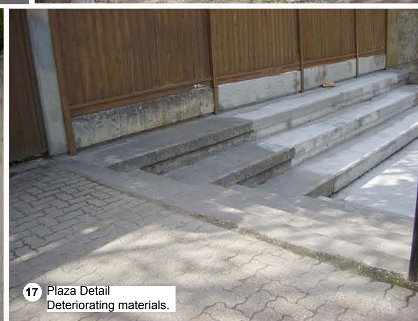
17 Plaza Detail Deteriorating materials.