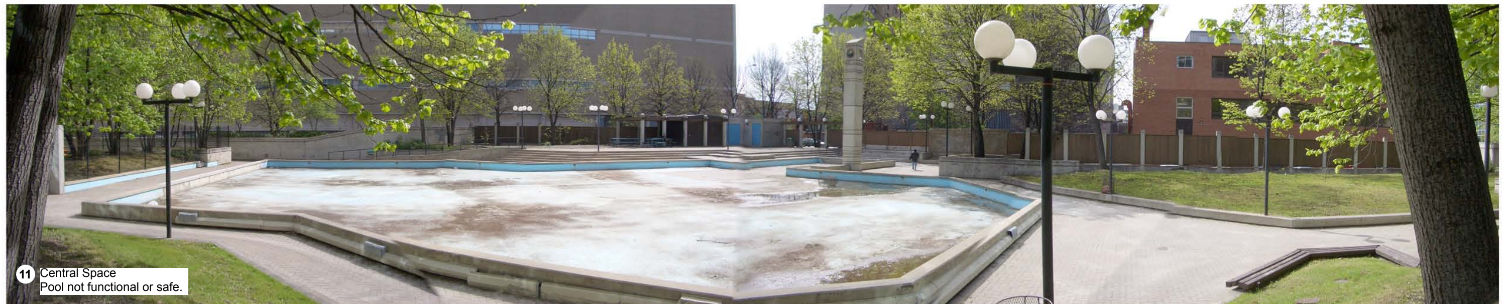
11 Central Space Pool not functional or safe.