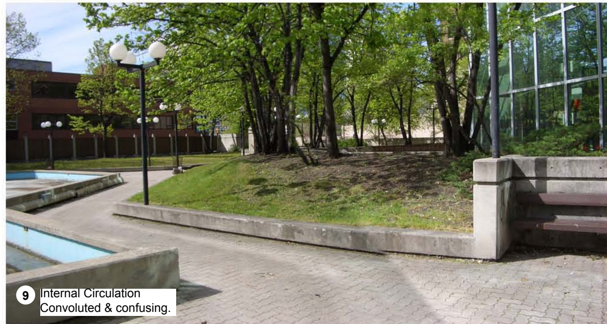
9 Internal Circulation Convoluted & confusing.