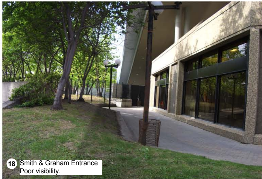
18 Smith & Graham Entrance Poor visibility.