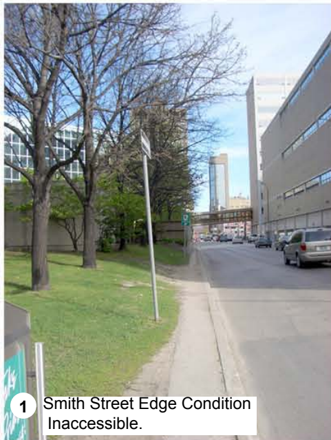
1 Smith Street Edge Condition Inaccessible.