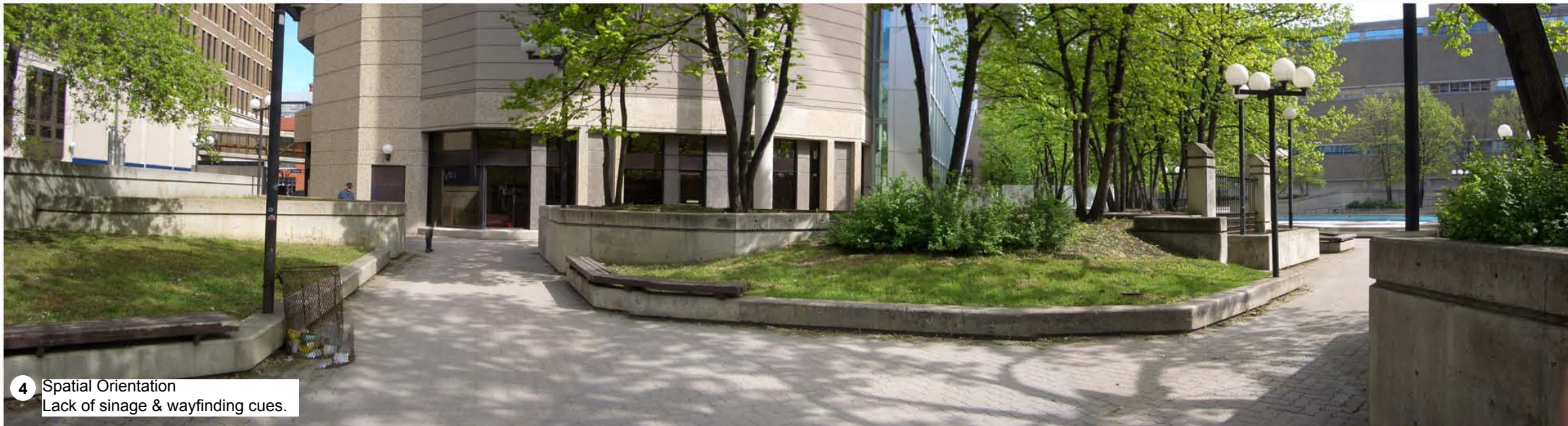
4 Spatial Orientation Lack of signage & wayfinding cues.