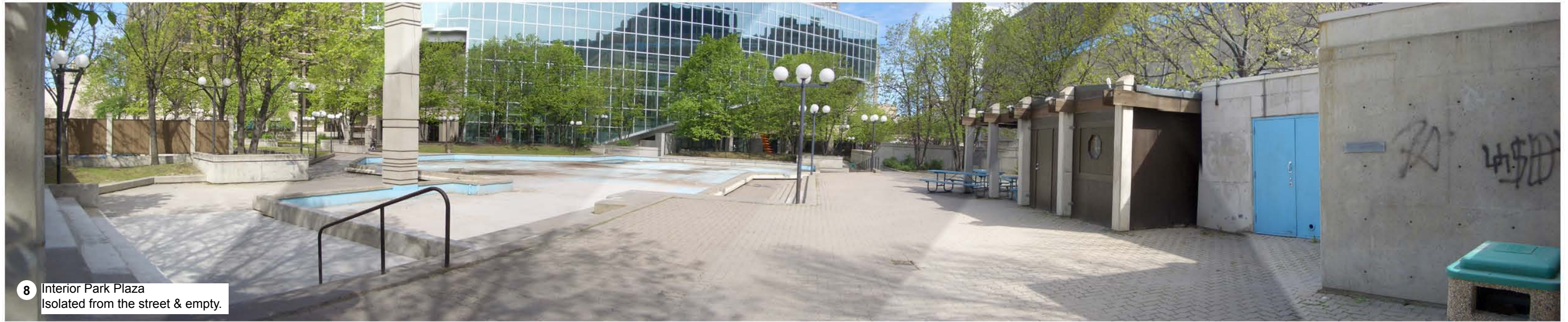
8 Interior Park Plaza Isolated from the street & empty.