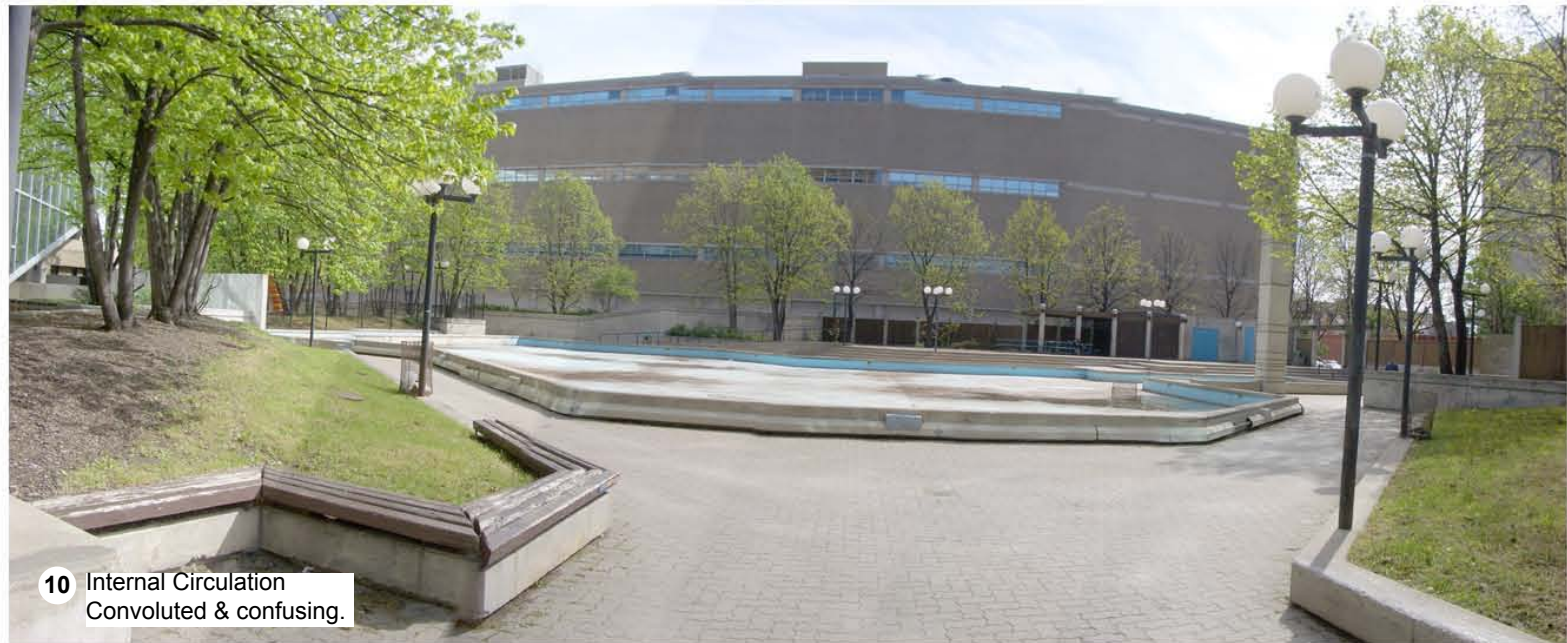
10 Internal Circulation Convoluted & confusing.