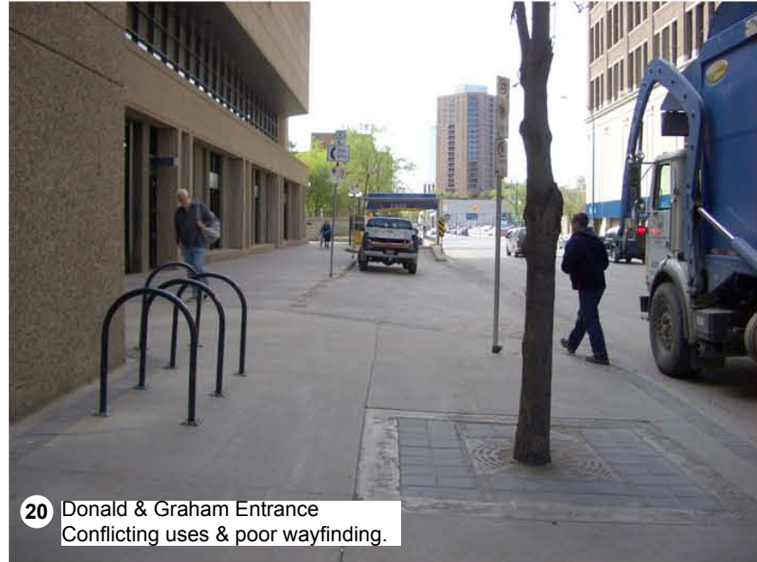
20 Donald & Graham Entrance Conflicting uses & poor wayfinding.