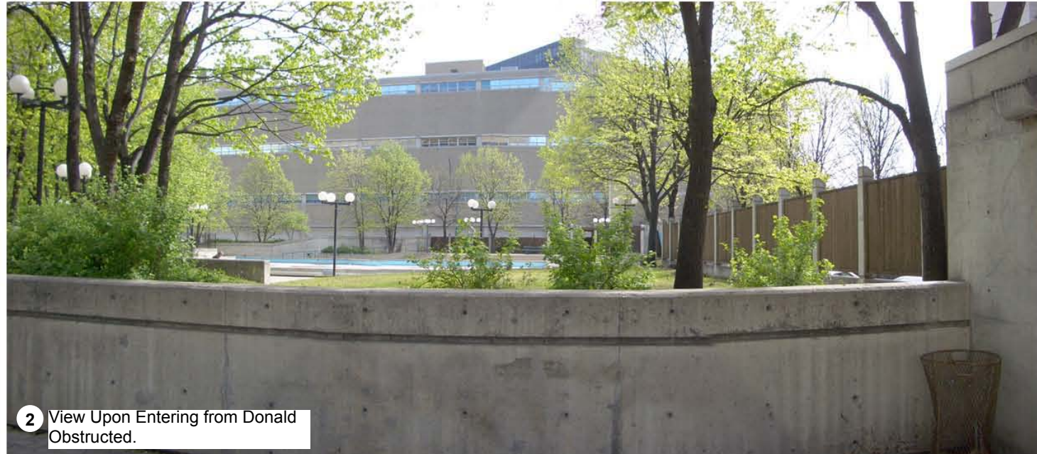
2 View Upon Entering from Donald Obstructed.