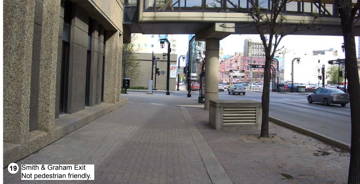
19 Smith & Graham Exit Not pedestrian friendly.