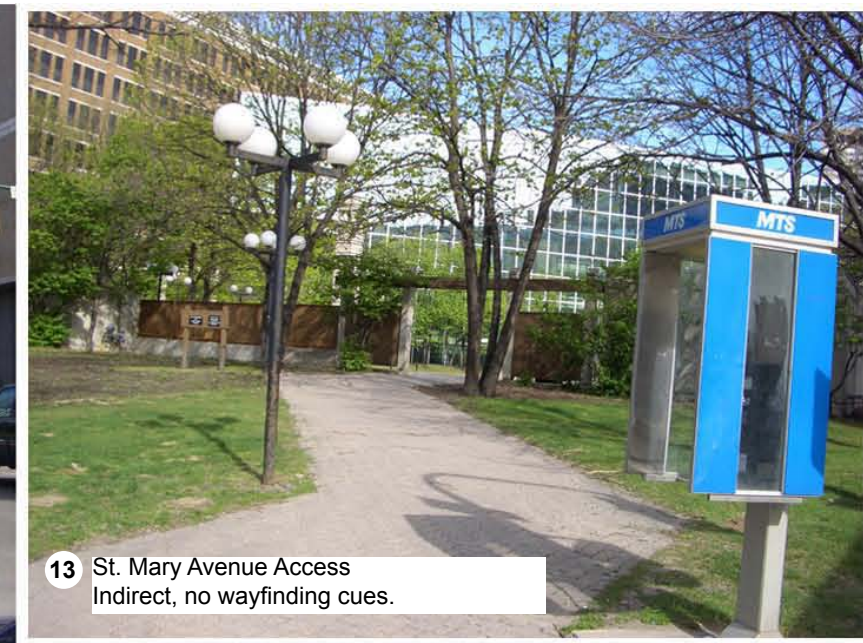
13 St. Mary Avenue Access Indirect, no wayfinding cues.