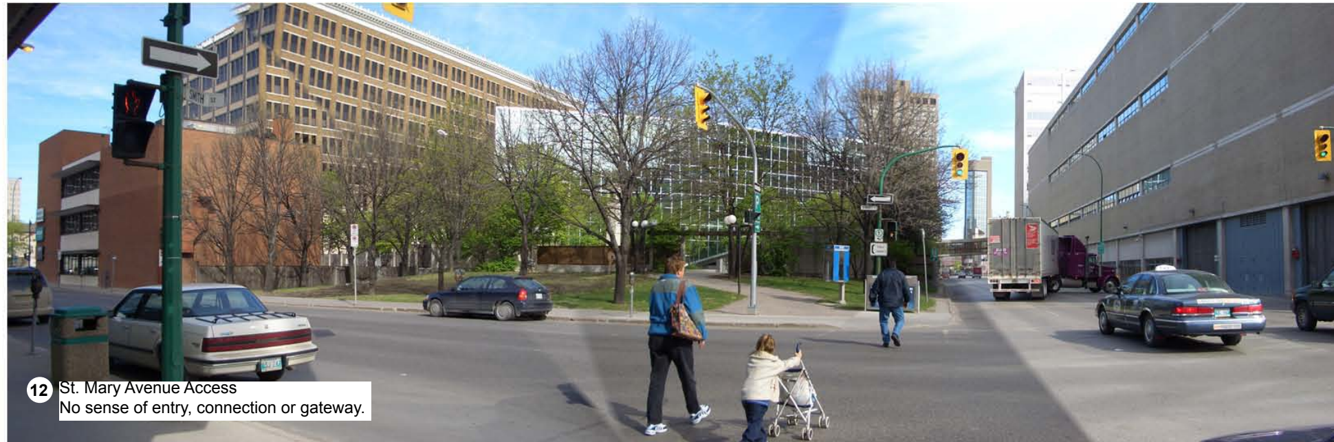
12 St. Mary Avenue Access No sense of entry, connection or gateway.