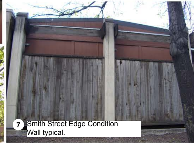
7 Smith Street Edge Condition Wall typical.