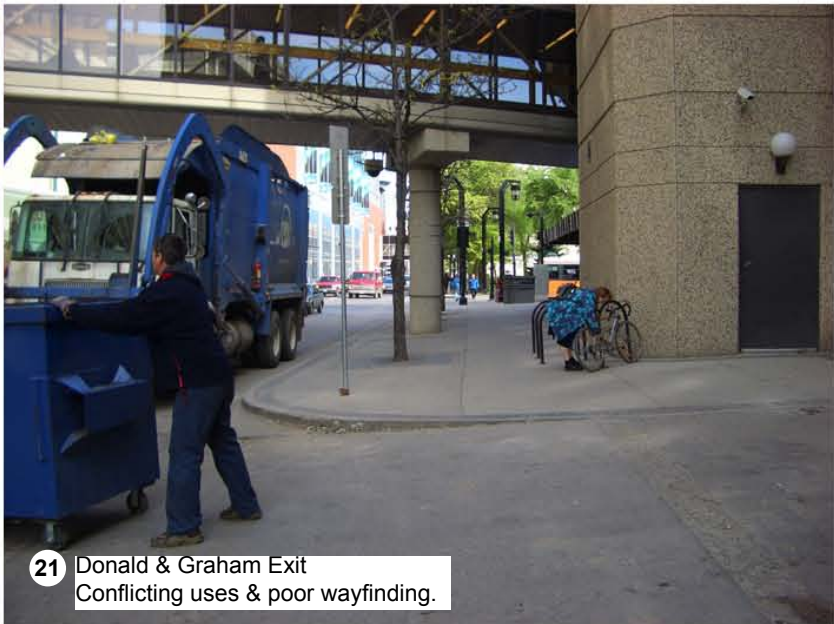
21 Donald & Graham Exit Conflicting uses & poor wayfinding.