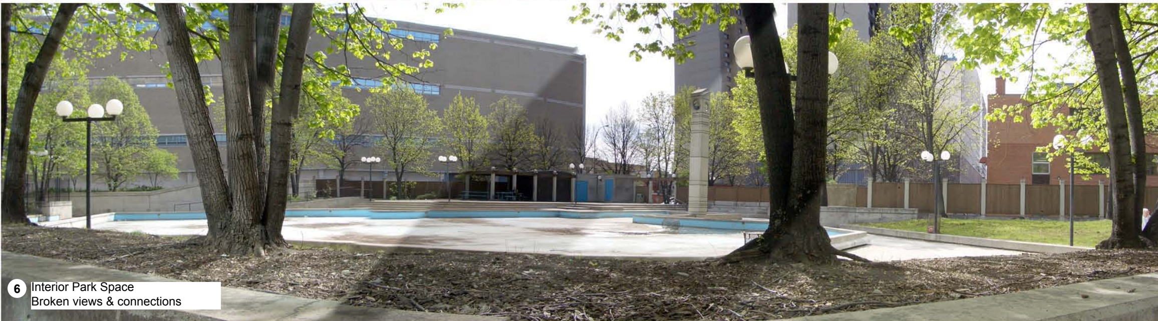
6 Interior Park Space Broken views & connections